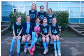
Bishop Wood School Netball Team

New netball posts have also been purchased for the playground. The netball team also received a new team kit.