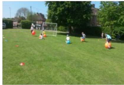
Bouncy Hopper Racing