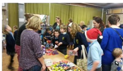
A busy Christmas Market stall.