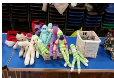
Christmas Market sock monkeys made by our Buddies.